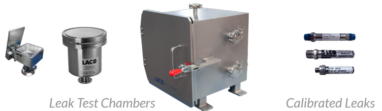
Leak Test Chambers