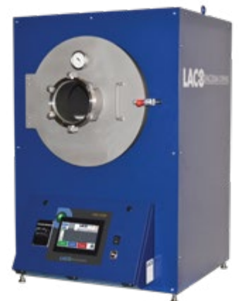
LACO Vacuum Oven with Integrated HVC-2500 Heat & Vacuum Controller

Includes all the features of the VC-2500, plus manual or auto heat control, automated thermal cycles and ramp rates, heat setpoint PID control (up to 2 zones), and multiple temperature reading display.