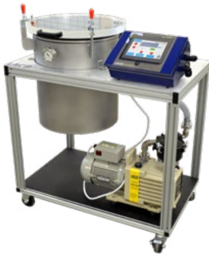
Table-top vacuum system with VC-2500 Vacuum Controller

Whether you need vacuum control, temperature control—or both—LACO’s family of controllers provides a comprehensive choice of control solutions for your vacuum system. From manual vacuum control to fully customizable software and test recipes, we thoughtfully designed each controller to support your price range and unique application.