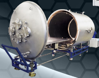
HEATED/COOLED PLATENS AND SHROUDS WITH CHILLERS