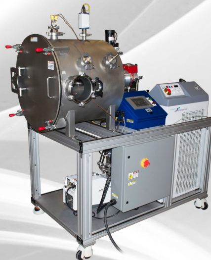
THERMAL VACUUM TESTING FOR SPACE SIMULATION