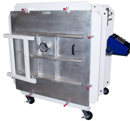
ALTITUDE SIMULATION TESTING/ ASTM TESTING