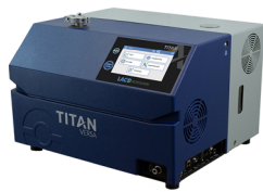
TITAN VERSA L | LD (wet or dry pump)