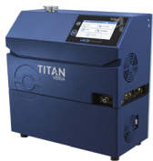
TITAN VERSA T | TD (wet or dry pump)