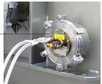
Internal view of Cold Finger vacuum system integration.